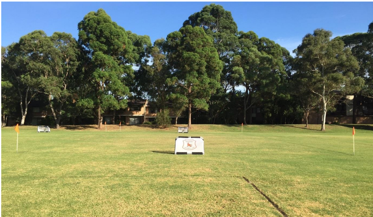
Correct set up of u6-u7 field

Fields 1, 2 and 3 require a corner post in each corner of the field and 2 goals for each field. The corner posts and goals are available in the storeroom next to the canteen (right hand side looking at the canteen). Assemble the goals once they have been carried out of the storeroom (not before!) to avoid any damage to the goals and nets. Similarly, the goals shall be disassembled prior to being carried to the storeroom at the end of the last game. The assembly and disassembly of the goals will be demonstrated during the first coaches and managers meeting and it will be the manager's (of the team that is on duty) responsibility to ensure that the goals are assembled and disassembled correctly. Refer to photo below for a correctly set up u6-u7 field.