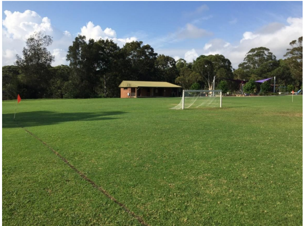
Set up of u8/9 field (one side shown only)

Field 4 is for the u8/9, and Field 5 is for U10/11/12 competitions. Goal posts are permanently on the field at all times, but nets (available in the storeroom) will need to be assembled onto the posts and crossbar. You simply attach the nets on the hooks that are provided on the goalposts. Green grass pegs are to be hammered into the ground to keep the net in place. Make sure there are no gaps so the balls don't roll through the bottom of the net. Corner flags and posts indicating the middle of the field (total 6 posts for each field) will need to be set up prior to the first game (refer photo below).