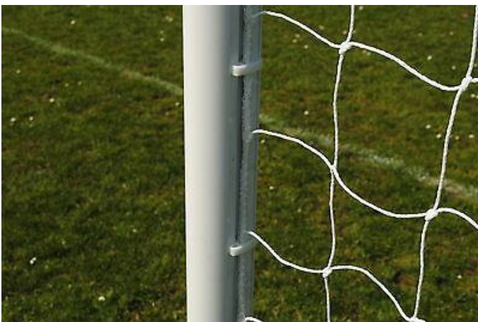
This shows you the hooks on the goals. You simply attach the net over the hook. These are attached on both field 4 & 5